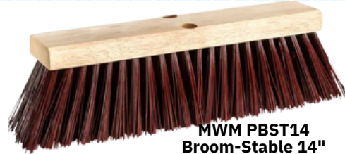
MWM PBST14 Broom-Stable 14" Sweeping Synthetic