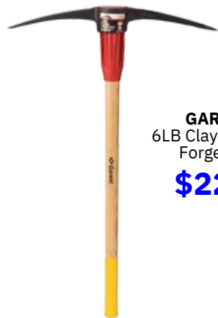
GAR HD40 6LB Clay Pick Head, Forged Steel